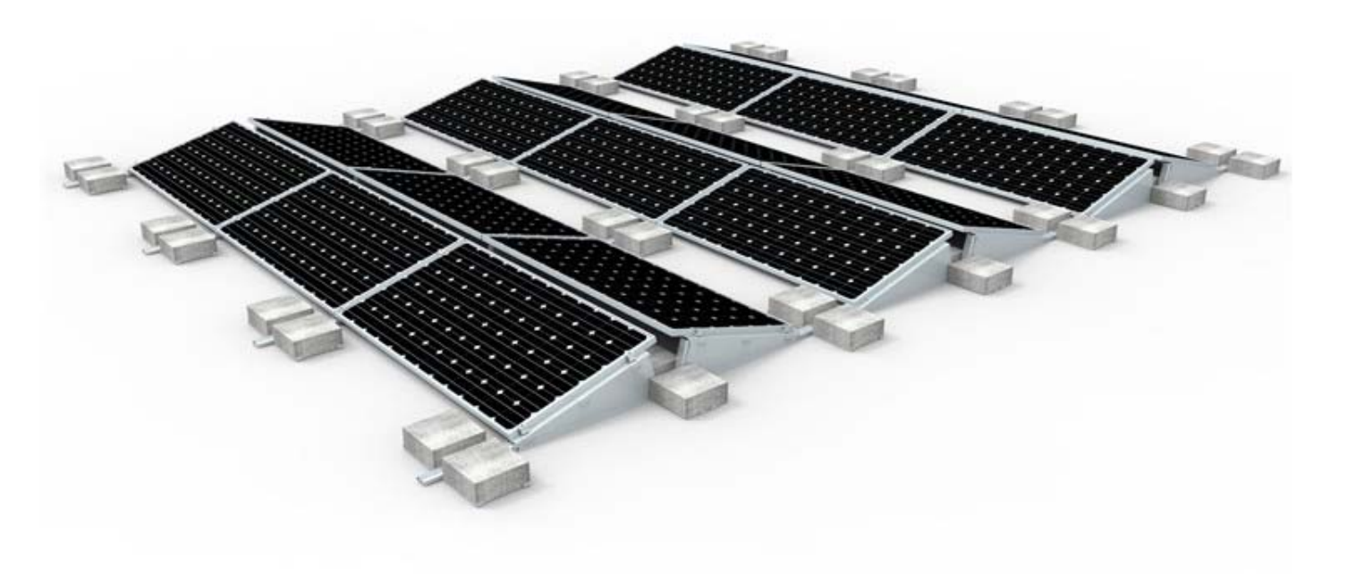
Fig.5: Bi-directional Design