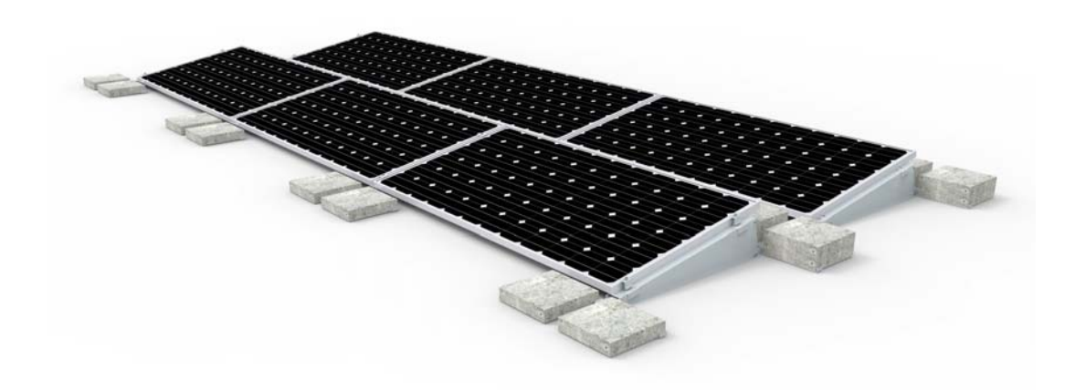
Fig.4: Single Direction Design

The same kits can be deployed in a single direction design (Fig. 4) or a bi-directional design (Fig. 5).